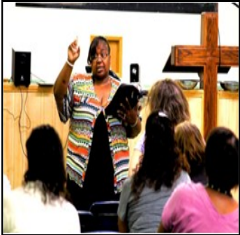
One day, as a special treat, a women's group gave hand massages & care packages!

The local community, KFIA, K-Love, Air1 and church groups helped make this a huge success! Many posted fliers and donation barrels to collect an abundance of clothing and a variety of much-needed items!